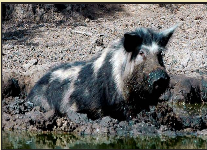
Figure 1. Feral hog wallowing along a water source.

Feral hogs impact water quality largely due to behavior related to their physiology. Because feral hogs do not have sweat glands, they commonly wallow in and near water sources to keep cool (Figure 1). This process covers their skin with mud that they rub off on trees and utility poles to remove external parasites.