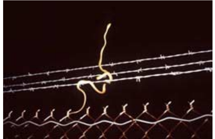
Figure 2— Though brown tree snakes cannot “leap tall buildings at a single bound,” they can climb impressively.

Brown tree snakes are excellent climbers. The fact that they can support their weight with their tail enables them to stretch both upward and sideways (fig. 2). The snakes can also coil their flexible bodies and hide in extremely confined spaces. Although most brown tree snakes live in trees in forest and scrub habitat, these snakes can be found almost anywhere.